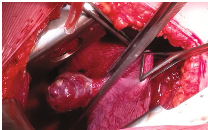
FIGURE 2: Intraoperative finding at 25 +4 weeks of pregnancy of the patient presented with dyspnea on multiple occasions from 20 weeks of pregnancy. Computed tomography pulmonary angiography at 24 weeks of pregnancy revealed isolated arteriovenous malformation.