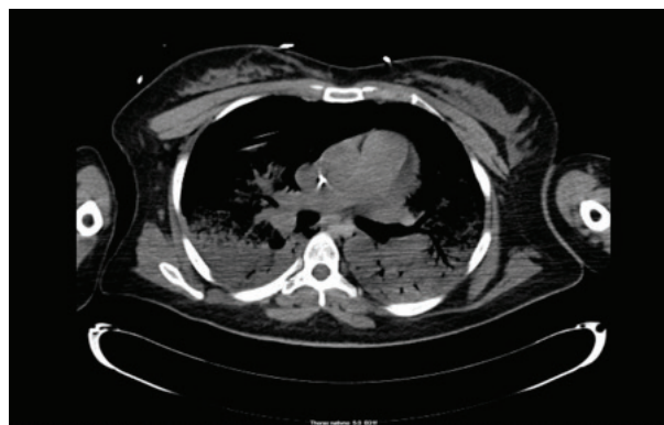
Fig. 3. MSCT of the thorax after thoracic drain placement.