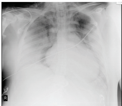
Fig. 1. Chest x-ray before thoracic drain placement.